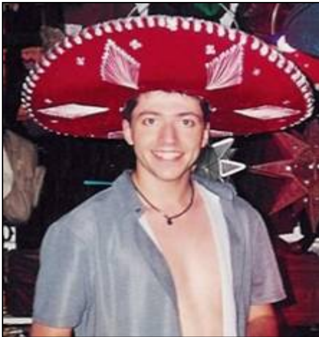
Me in Cancun, Mexico, April 2000

That's the most important thing to me. My freedom. Heck, look at the smile on my face in these photos!